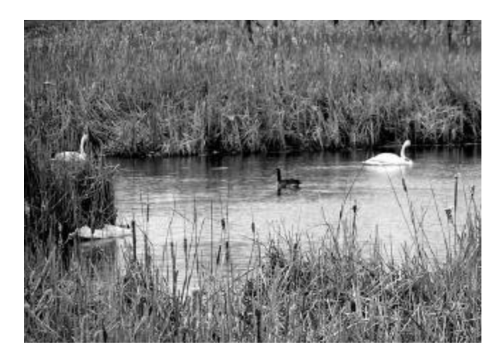
Swans located in Grant on April 4, 2004